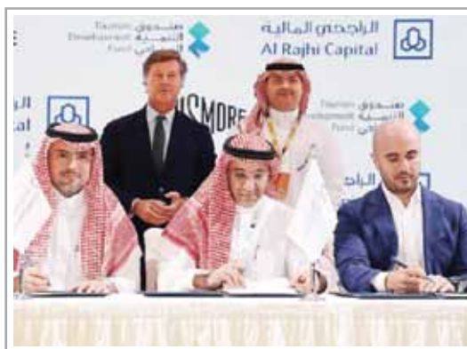
$400 mn to be invested in Ennismore's lifestyle hotels in KSA