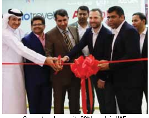
Cozmo travel opens its 20th branch in UAE

Sharjah to host region's first Footgolf Tournament