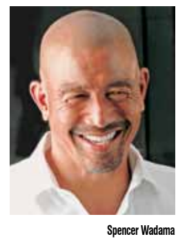
General Manager SLS Hotel and Residences

I believe we are now at the stage where we are returning to normality and luxury travel today is becoming similar to the pre-covid era. I think the main difference is the awareness of hygiene amongst travellers. Guests are much more appreciative of, and are actively looking for, properties and brands that maintain high levels of hygiene standards. We also need to stay relevant to Generation Z.