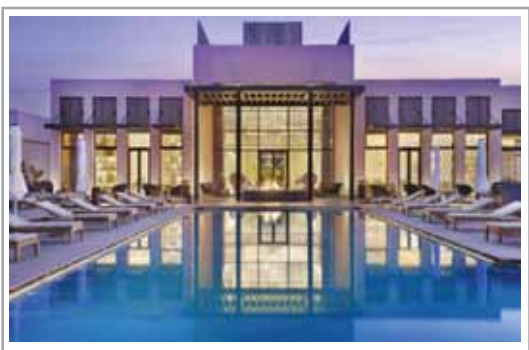
Conrad Hotels and Resorts debuts in Morocco